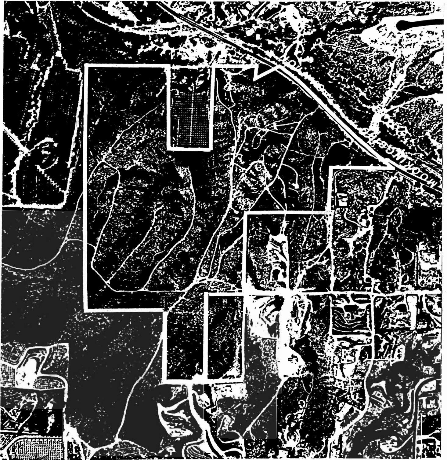
FIGURE I.3 AERIAL PHOTO