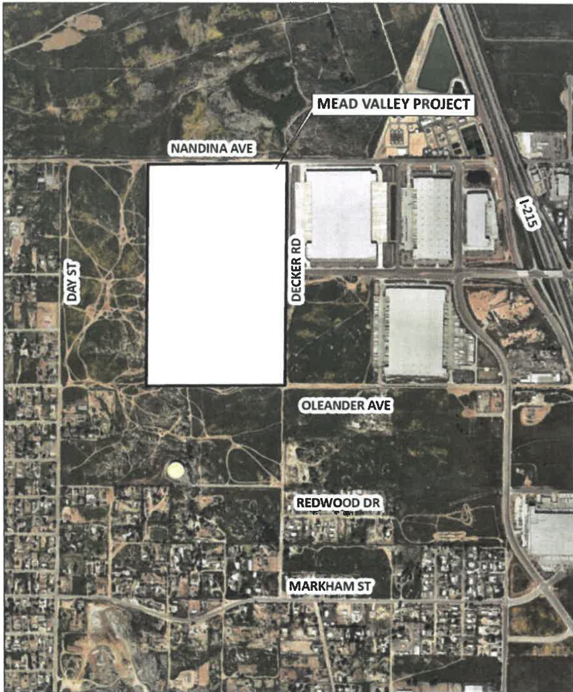
Figure 2: Project Location