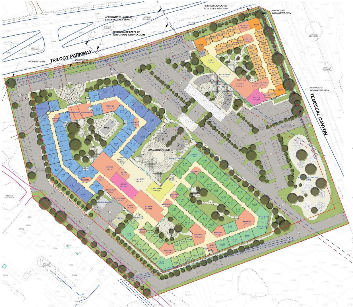
EXHIBIT 1-B: SITE PLAN