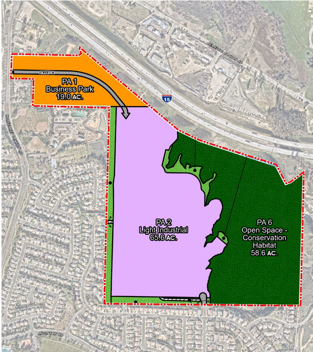
EXHIBIT 1-B: LAND USE PLAN

LEGEND: N [Red dashed line symbol] Site Boundary