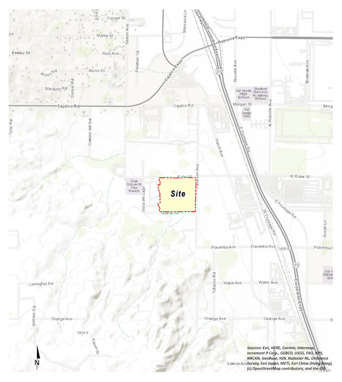
EXHIBIT 1-A: LOCATION MAP