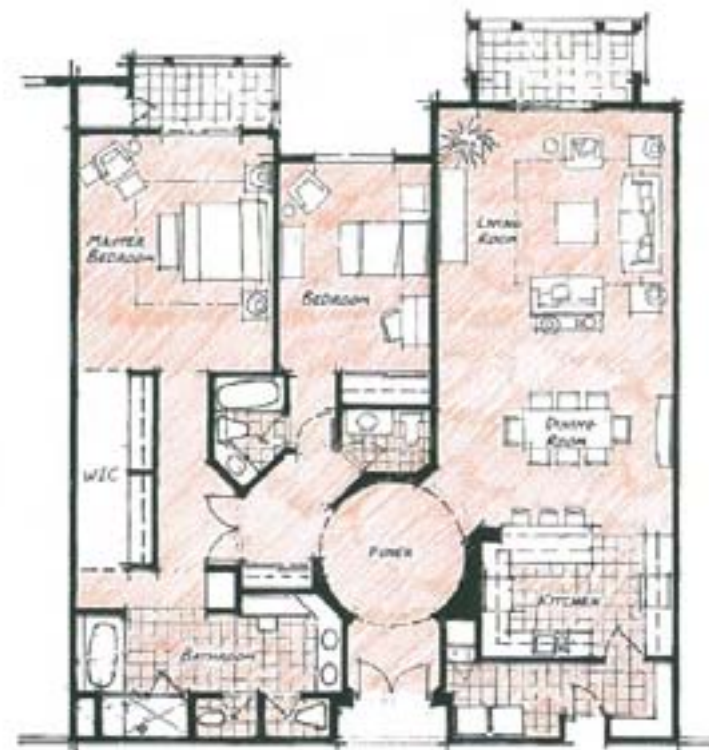
Typical Unit Plan