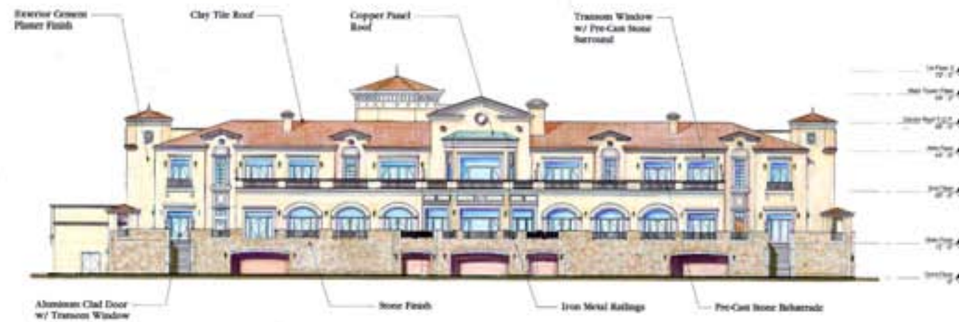
Rear Elevation - North