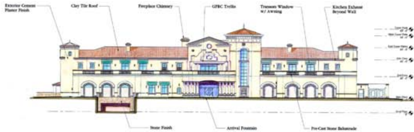
Front Elevation - South