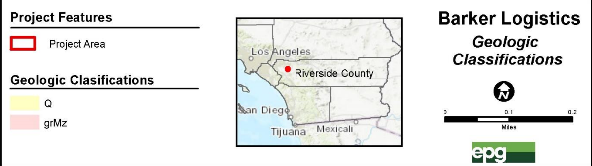
Figure 2. Project Boundaries and Geological Layer