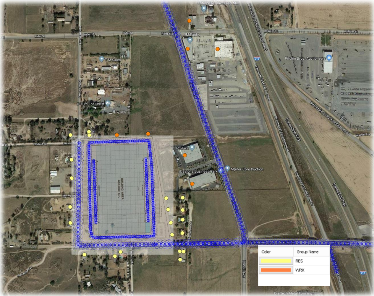
EXHIBIT 2-B: MODELED RECEPTORS