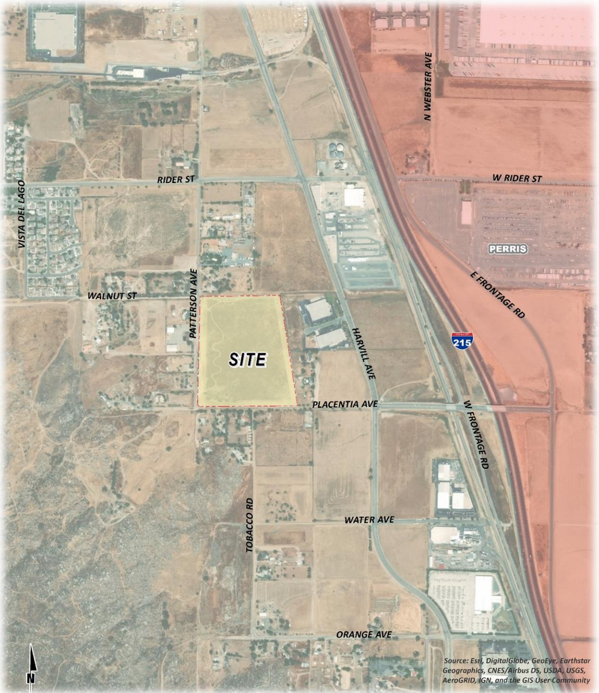
EXHIBIT 1-A: LOCATION MAP